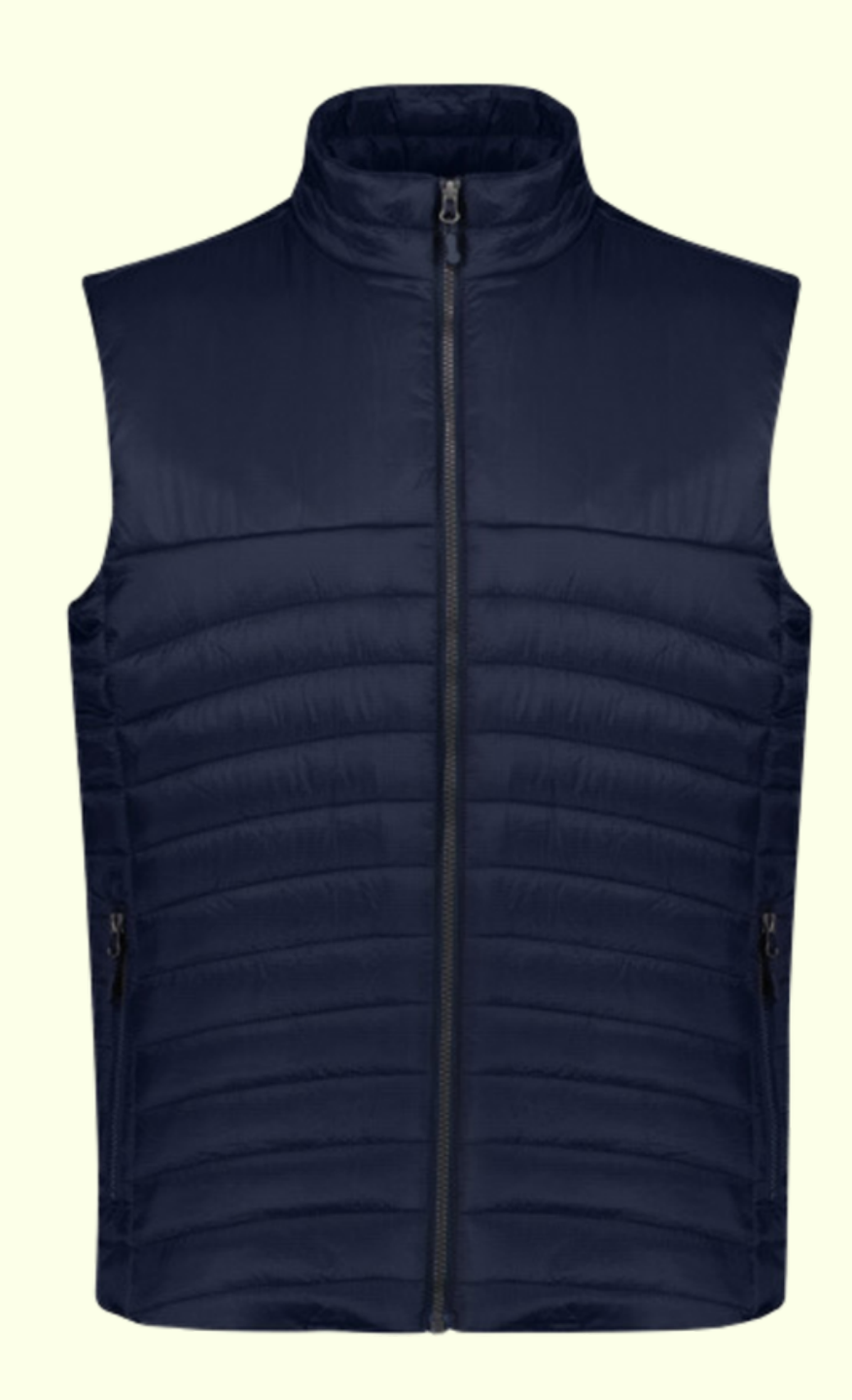
FBJ211L-NVY Ladies softshell vest

The lining of the jacket is made from 100% polyester, offering a comfortable and soft interior.